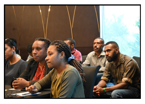
Fig2.4 Participants looking on as presentations are in session