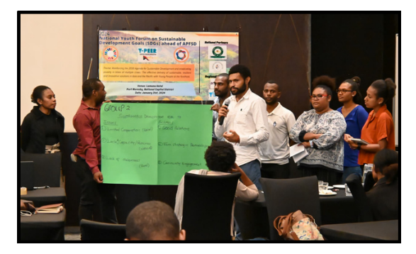
Fig3.3 Group 4 participants present their discussions