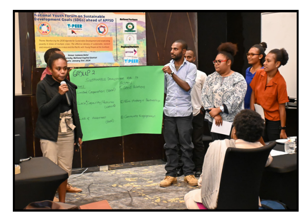
Fig4.2 Group 4 participants amid presentation