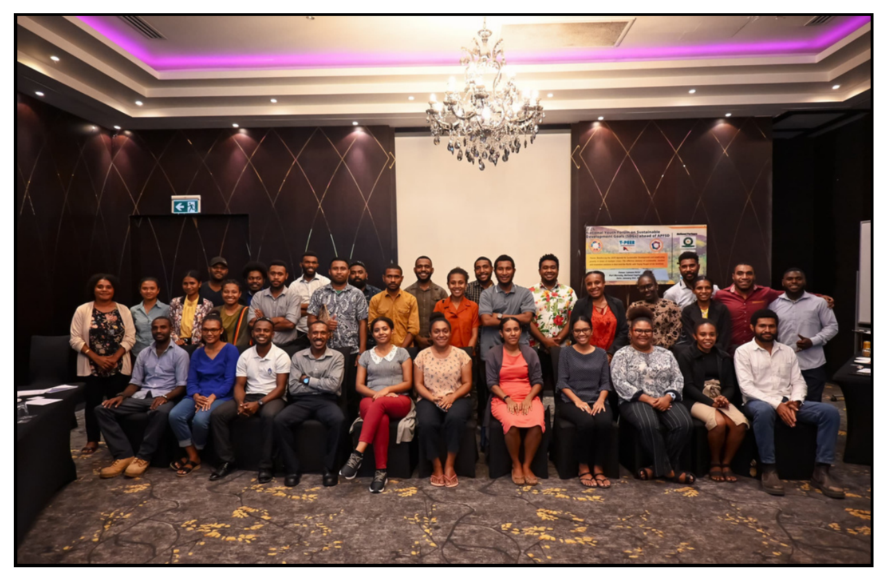
Fig5.0 Group photo of participants after close of program

The Youth Forum on SDGs marked a significant milestone in fostering youth-led initiatives for sustainable development. The event provided a platform for robust discussions, actionable solutions, and commitments towards driving positive change in Papua New Guinea.