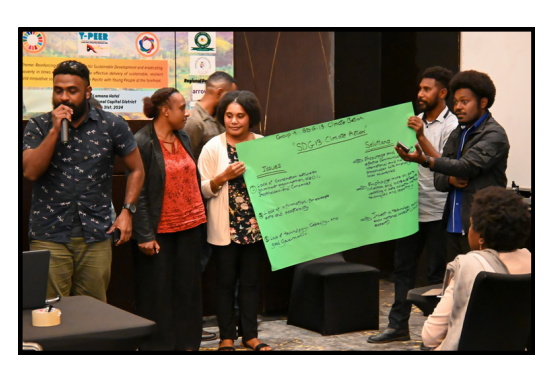
Fig3.2 Group 2 participants present their discussions