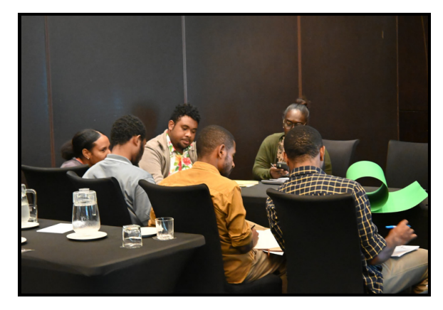
Fig4.1 Group 3 participants amid discussions