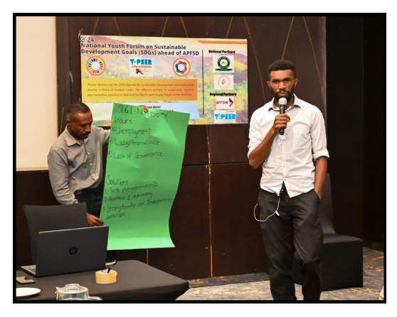
Fig4.2 Group 1 participants amid presentation